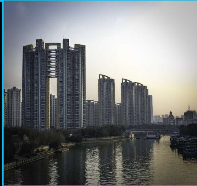
Indian Real Estate Market: Bengaluru, Mumbai Grow 7.1% and 7%, NCR at 6%; Singapore Leads with 13.7% Growth knight Frank Forecasts Continued Indian Demand Amidst Global Constraints; Hong Kong Faces Challenges"

Explores the profound shift towards environmentally conscious practices in real estate. From energy-efficient building materials to LEED certification and eco-friendly amenities, sustainability is becoming a cornerstone of property development and investment. This evolution reflects a growing awareness of climate change and a desire for greener, healthier living spaces. Moreover, sustainable features not only reduce environmental impact but also enhance property value and appeal to eco-conscious buyers. As sustainability continues to gain momentum it is reshaping the way real estate is conceived, built, marketed, and valued in the modern world.