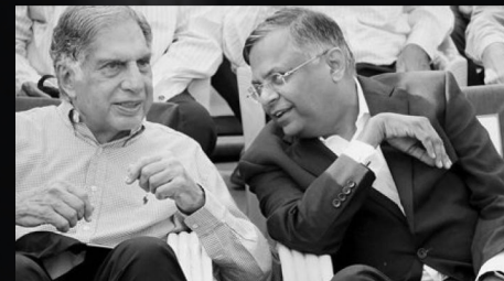
Late Mr. RATAN NAVAL TATA